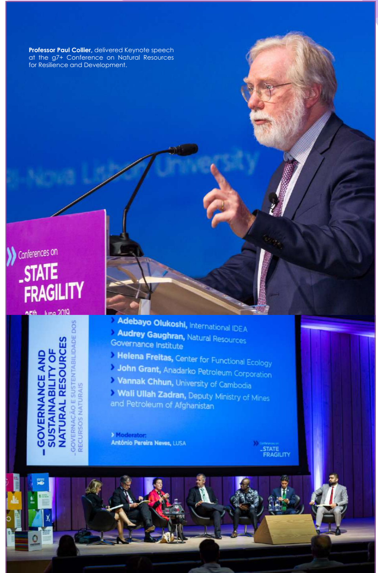
Professor Paul Collier, delivered Keynote speech at the g7+ Conference on Natural Resources for Resilience and Development.

An outreach program was conducted in coordination with different local organizations and local authorities to share the work of g7+ more broadly to new audiences in Timor-Leste. The program has covered six (6) municipalities out of thirteen (13) and will continue to reach out to other municipalities in 2020.