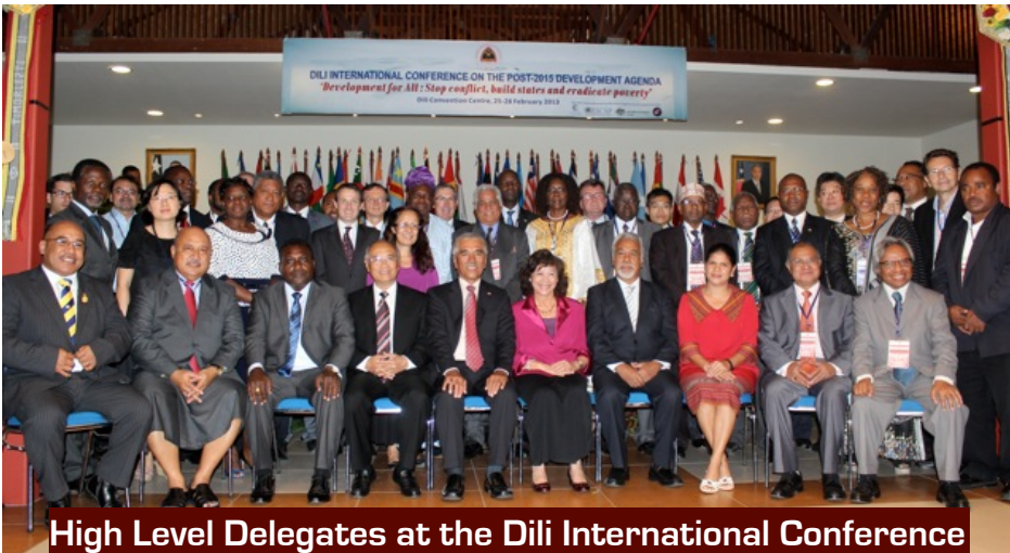
High Level Delegates at the Dili International Conference